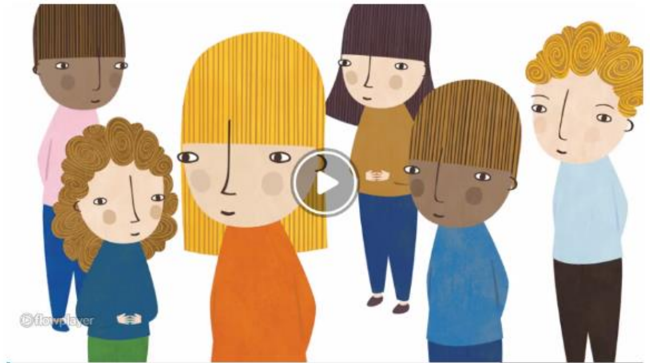
Video: Identifying signs of abuse